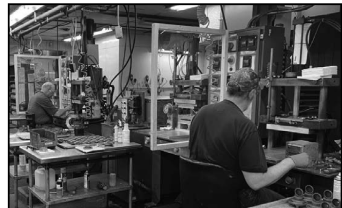
New work station dividers were installed to keep employees safe when a 6-foot distance wasn't possible to keep operations moving.

The machine is a 5HP screw air compressor that will provide more efficient processing.