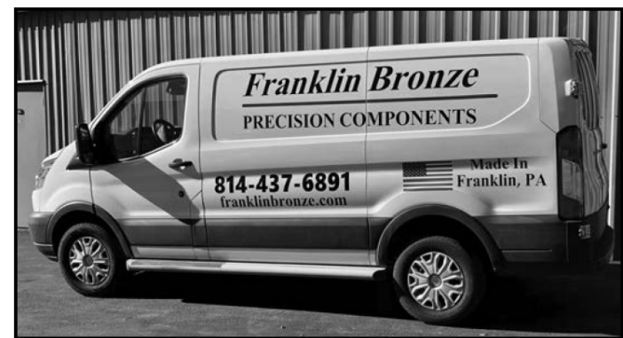
A new van was added to the company's fleet last year. Branding work on the new van was done by a local company, Clark Graphics.